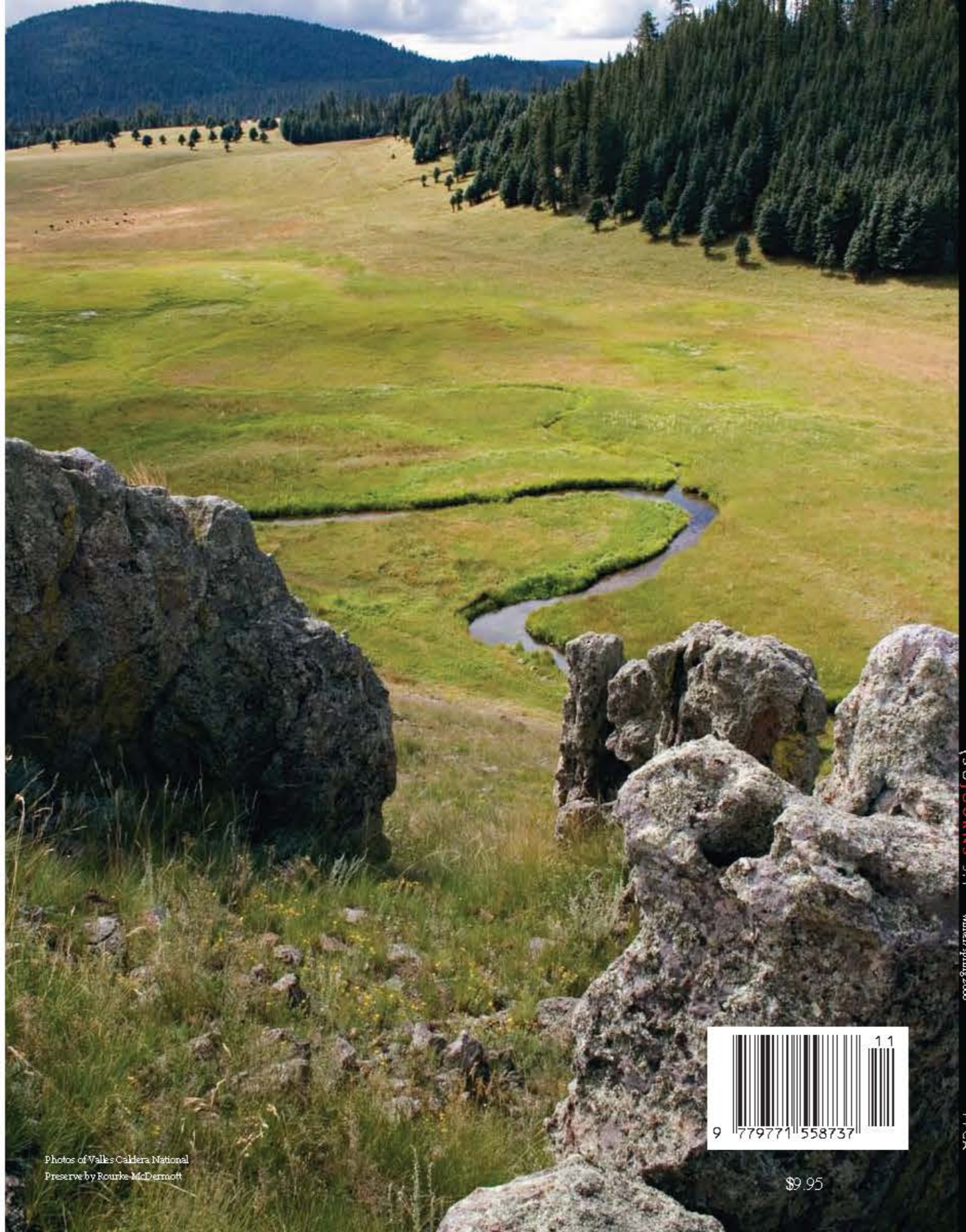
Photos of Walks Caldera National Preserve